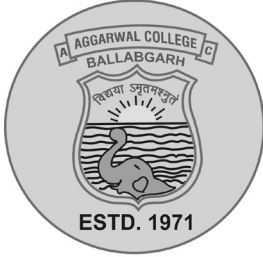
Aggarwal College Ballabgarh Faridabad, India