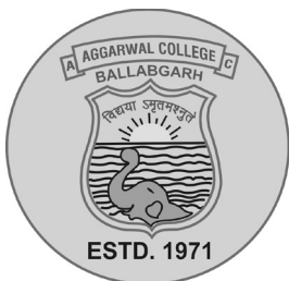
Aggarwal College Ballabgarh Faridabad, India